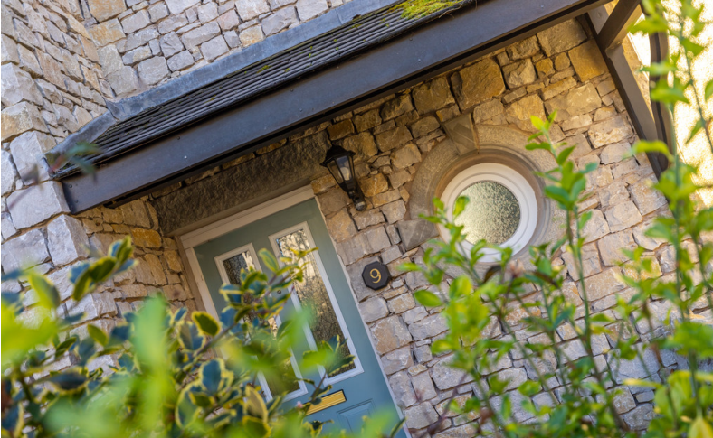
9 Town Head Fold

Step inside to discover a thoughtfully designed layout, starting with a convenient downstairs toilet to the right and a handy understairs storage cupboard. The property showcases a high-quality finish, evident from the moment you enter.