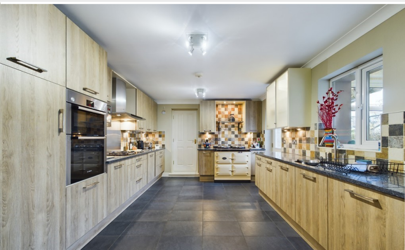
Kitchen Dining Room