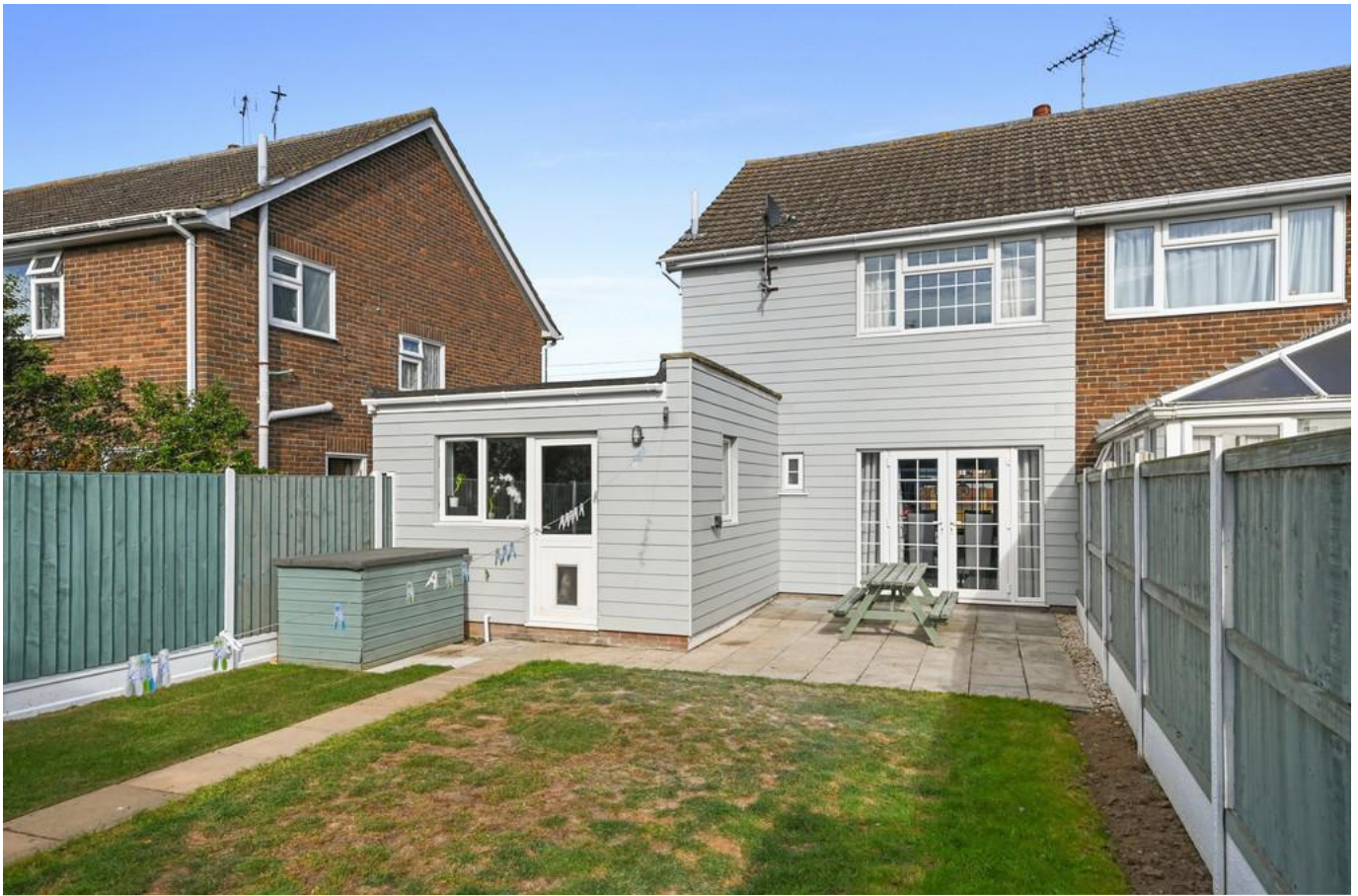
Anchor Road, Tiptree CO5 0AP