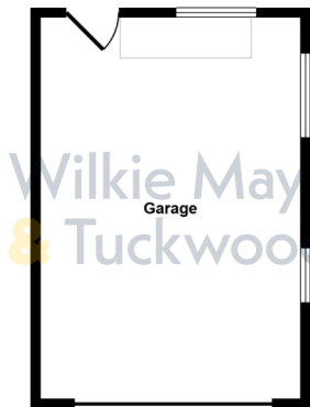
Garage Approx 22 sq m / 234 sq ft

This floorplan is only for illustrative purposes and is not to scale. Measurements of rooms, doors, windows, and any items are approximate and no responsibility is taken for any error, omission or mis-statement. Icons of items such as bathroom suites are representations only and may not look like the real items. Made with Made Snappy 360.