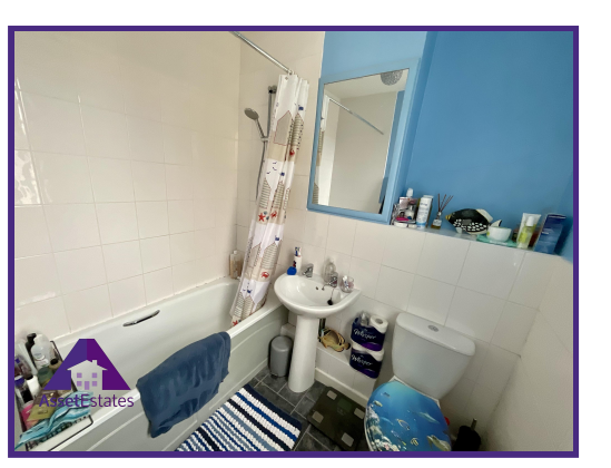
Rhiw Parc Road, Abertillery, NP13 1EW