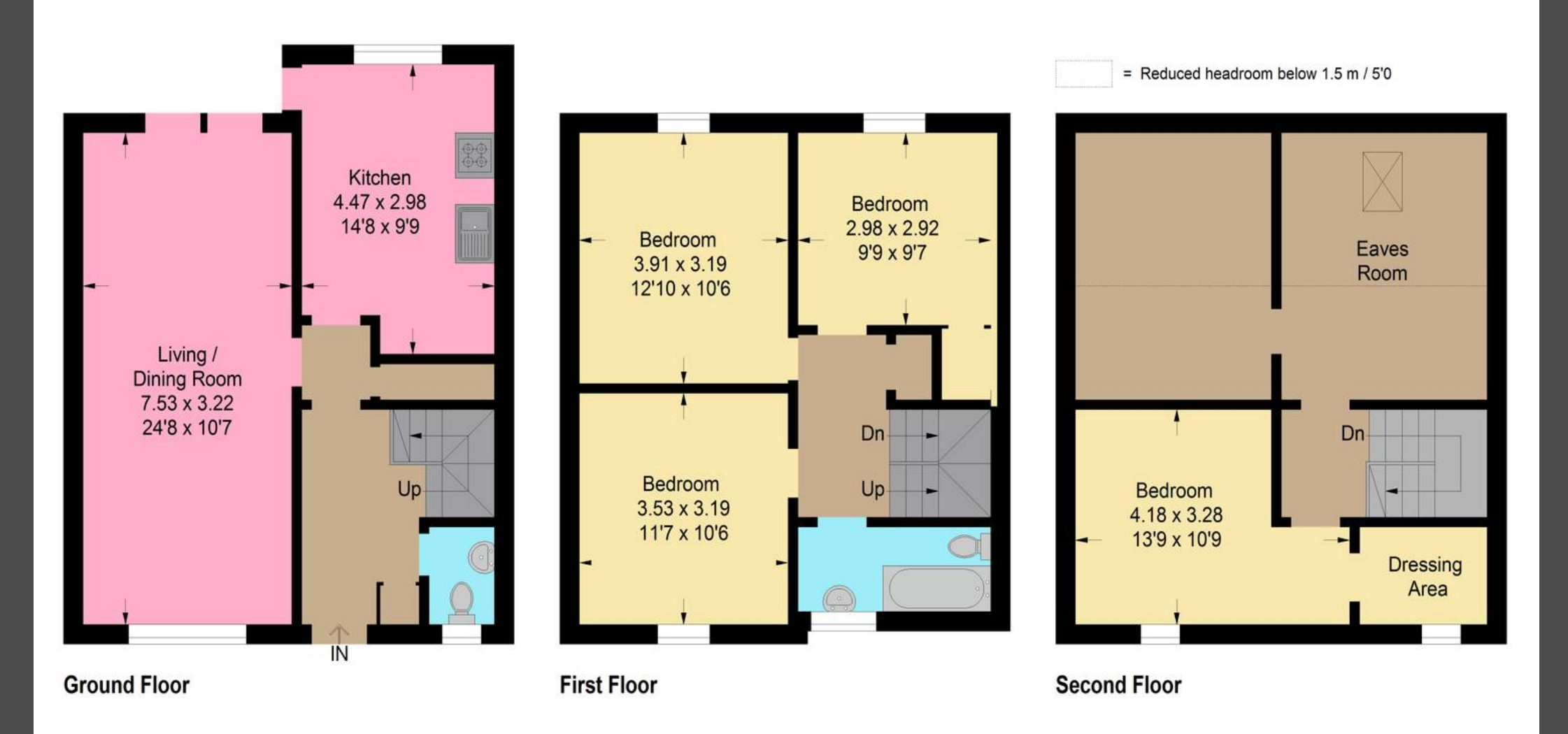
Illustration For Identification Purposes Only. Not To Scale (ID:1148620 / Ref:89640)