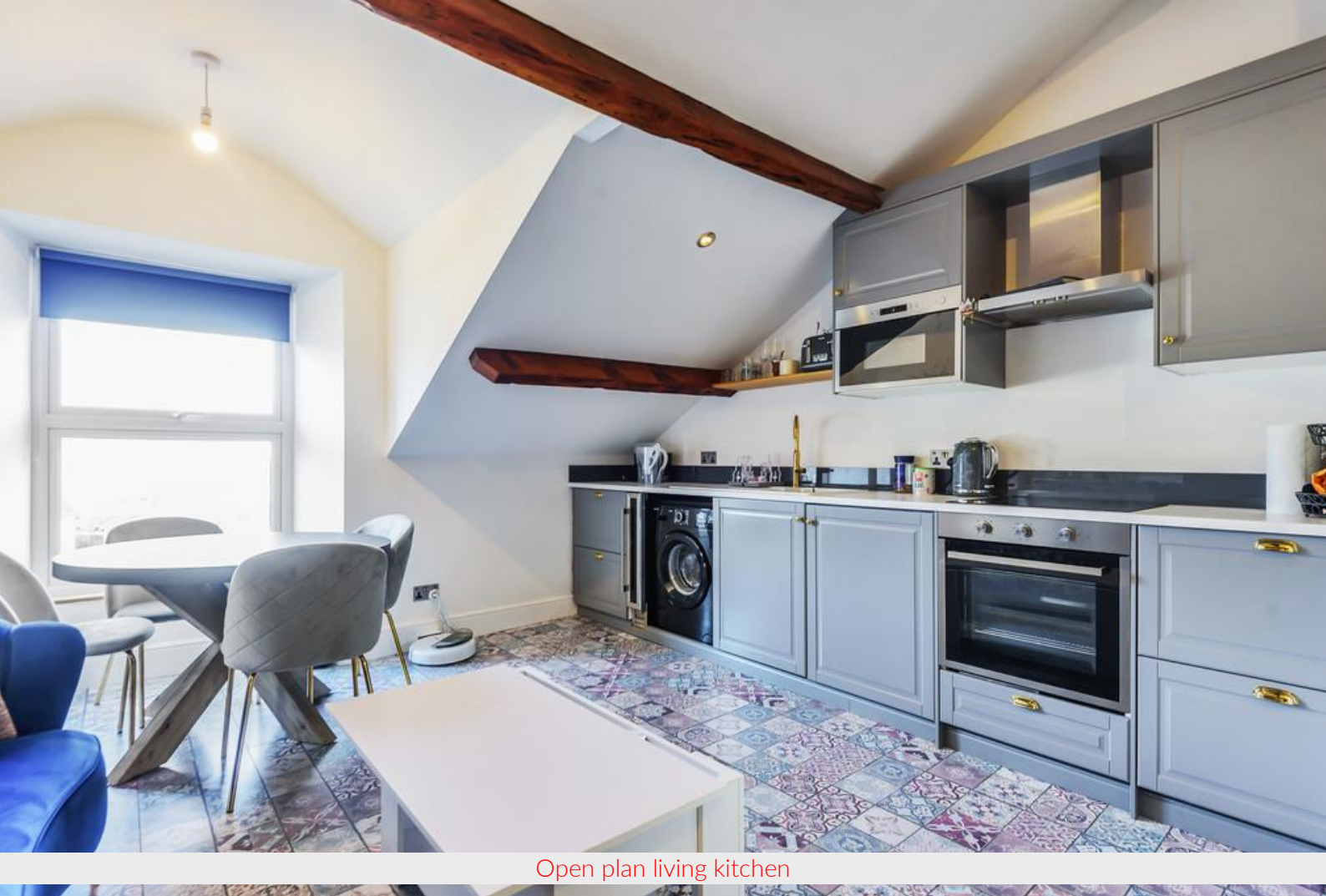
Open plan living kitchen

Location: Located in central Bowness, with access to the flat off Bank Terrace, opposite the public carpark on Lake Road, above the 'Urban Food House' restaurant. Access from the rear of the building up a metal staircase to the second floor.