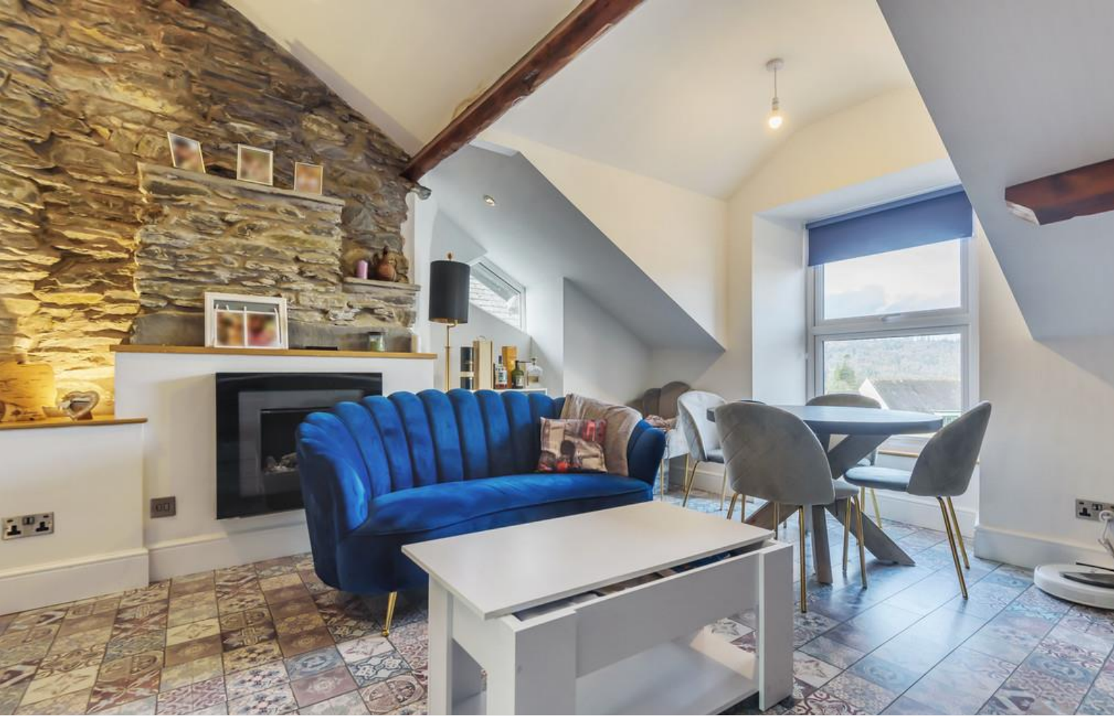
Open plan living kitchen