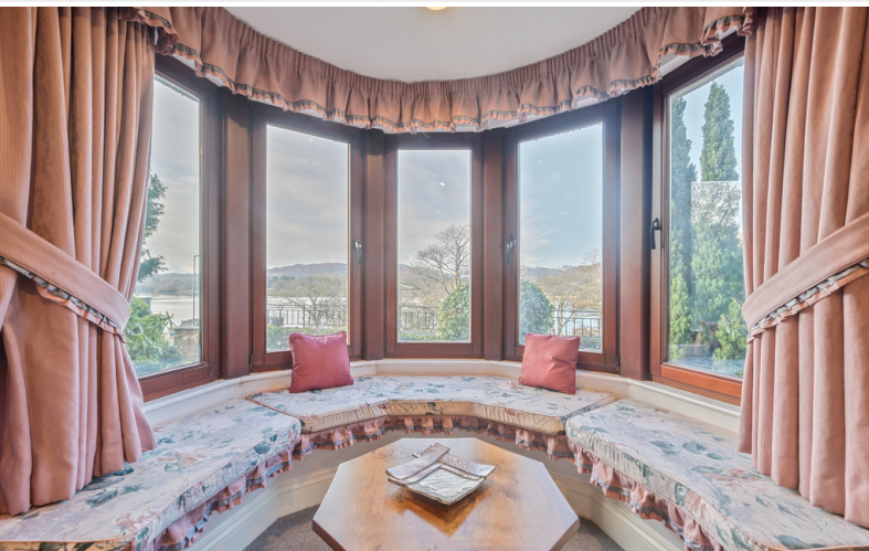
Living Room View