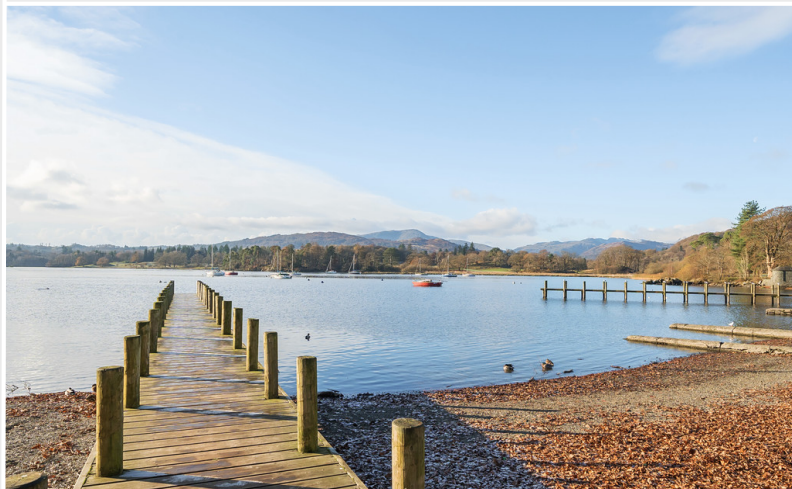
View of Lake Windermere