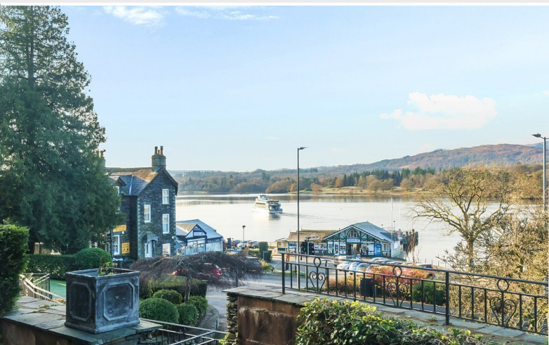
View of Lake Windermere

Having its own private entrance, high ceilings and a fabulous bay window in the large living room showcasing the breath-taking views of Lake Windermere and the surrounding fells, this apartment really is one not to miss!