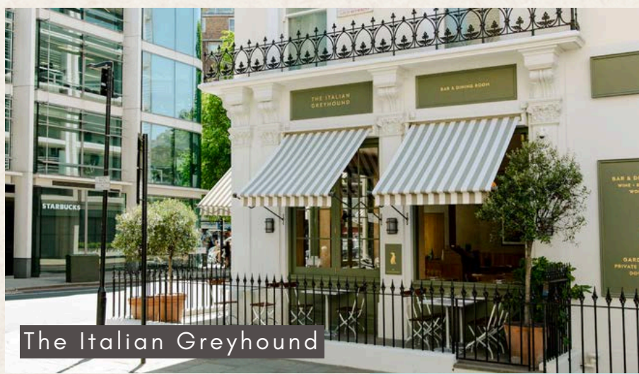
The Italian Greyhound