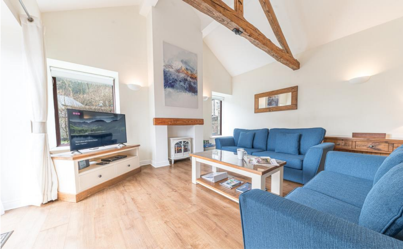
Open Plan Living/Dining Kitchen