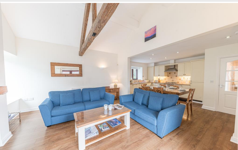
Open Plan Living/Dining Kitchen

Description This lovely stone and slated Semi-Detached Barn Conversion has well presented lateral living and benefits from a Garage, Parking Space and small Garden.