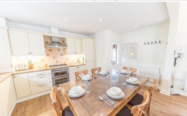
Open Plan Living/Dining Kitchen