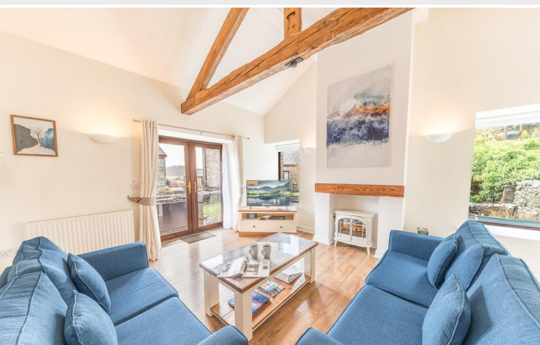
Open Plan Living/Dining Kitchen