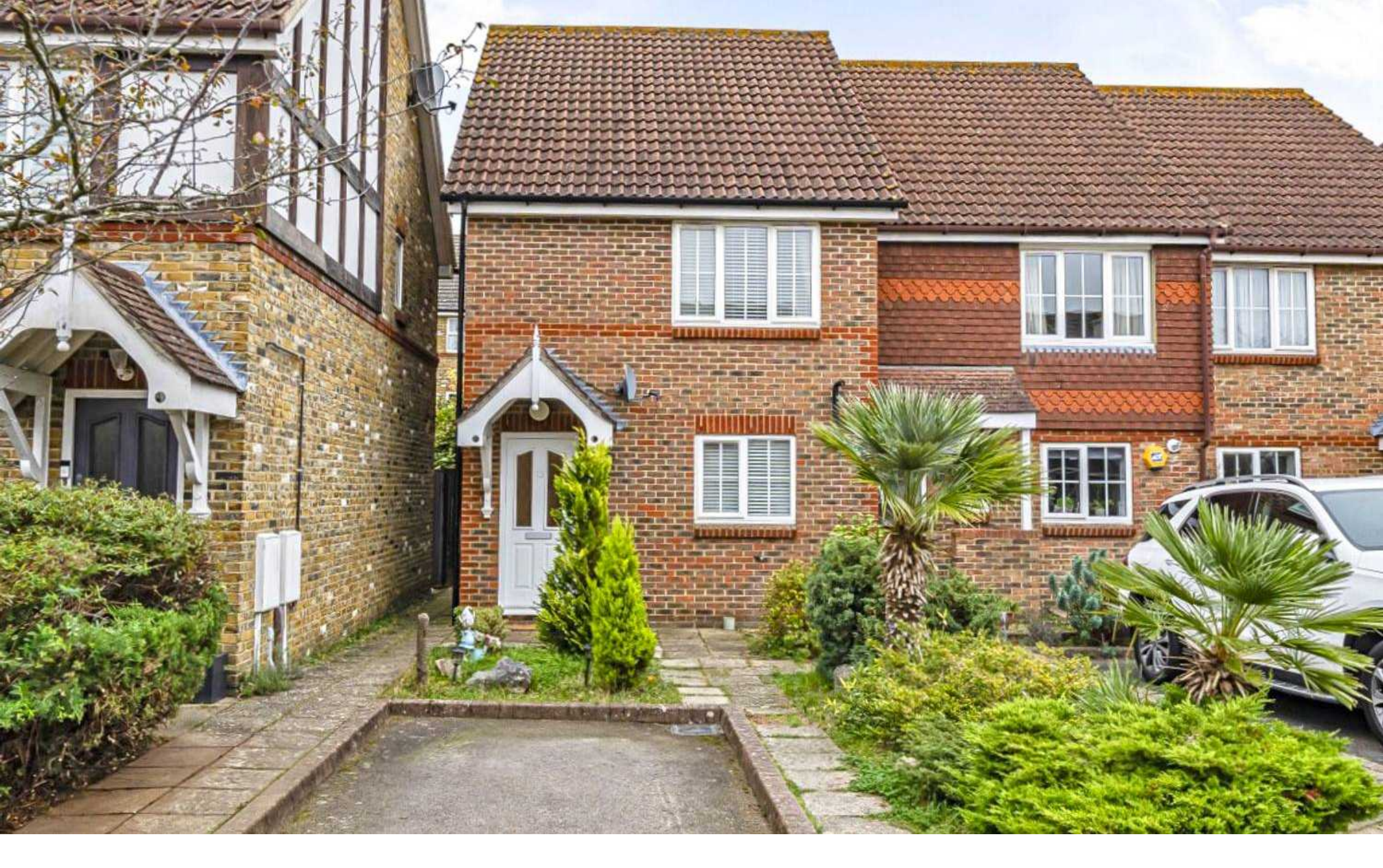
13 Hornchurch Close, Royal Park Gate, Kingston Upon Thames, KT2 5GH £720,000