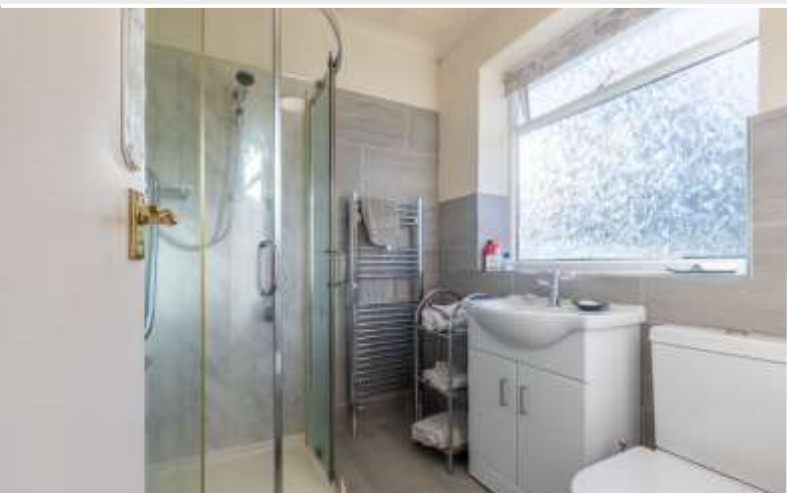
Ground Floor Shower Room

Upon entering the property, you are welcomed by the inviting hallway featuring a spacious walk-in storage cupboard. To the left, you'll find the living room, beautifully lit by a large front-facing window that floods the space with natural light. A charming focal fireplace set on a stone surround adds a touch of warmth and creates a cosy atmosphere.