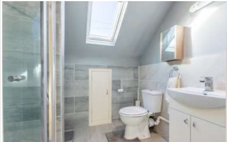
First Floor Shower Room