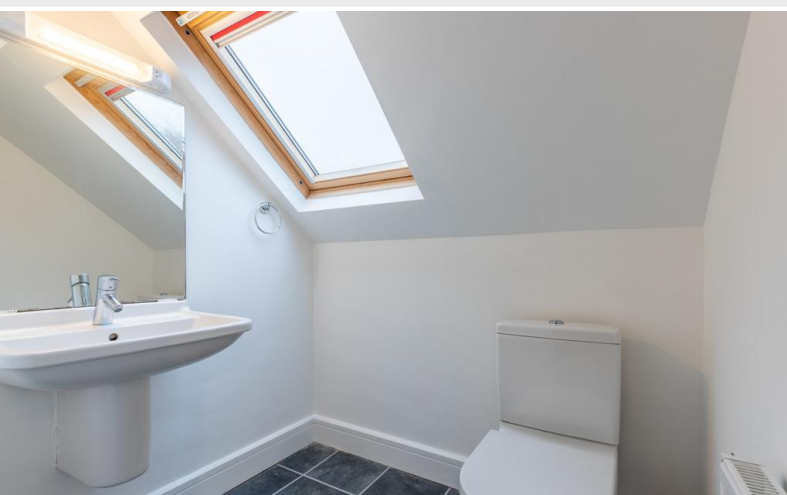
First Floor W.C