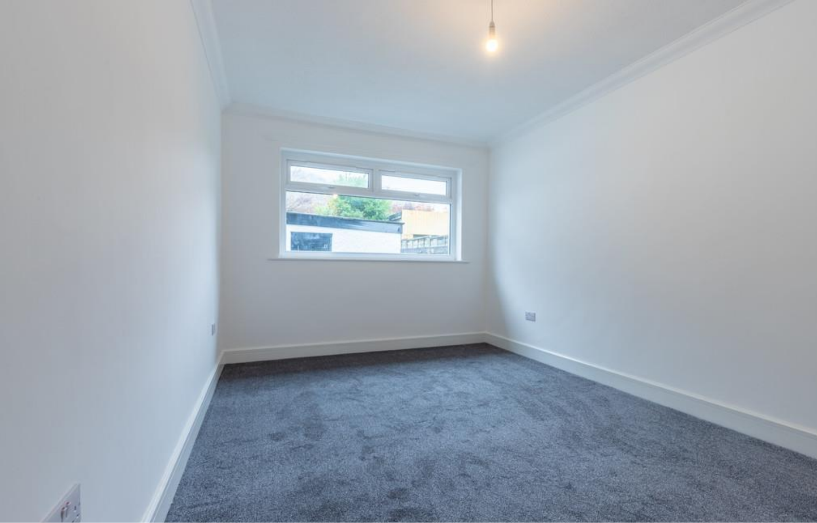
Bedroom Four/Dining Room