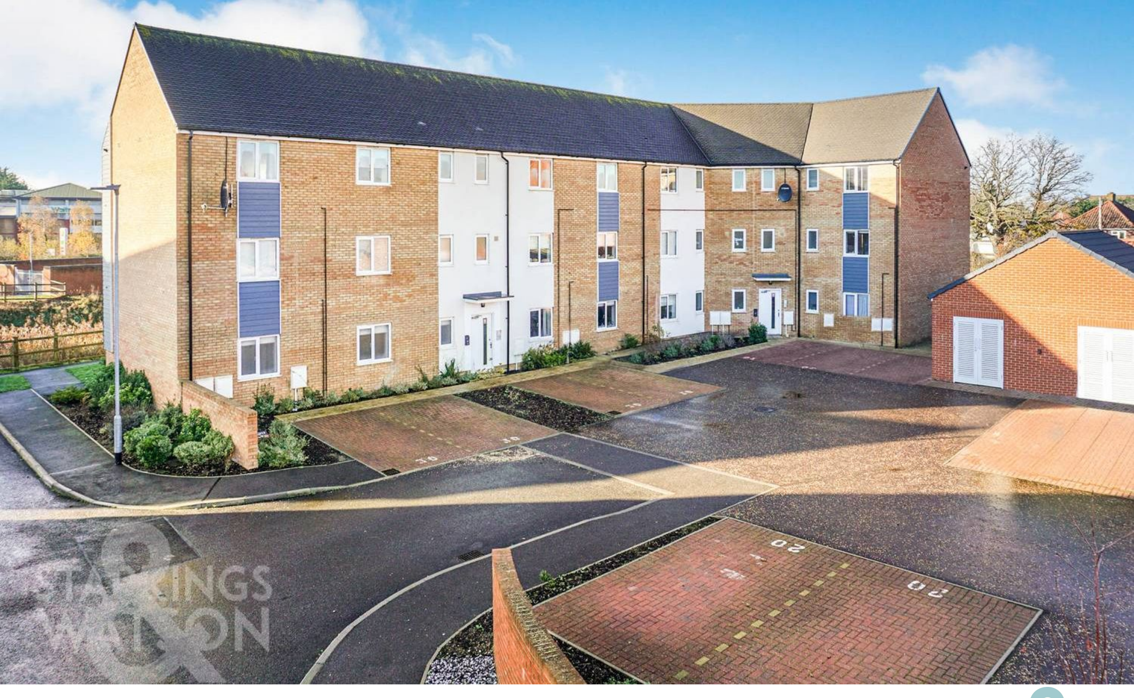
Tipperary Avenue, Wymondham - NR18 0ZA