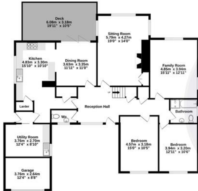
Ground Floor 151.3 sq.m. (1629 sq.ft.) approx.