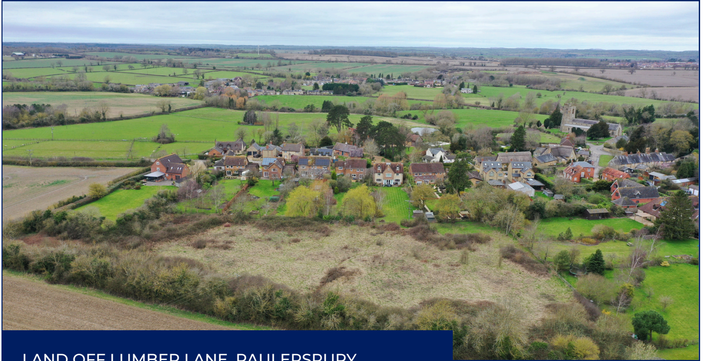
LAND OFF LUMBER LANE, PAULERSPURY