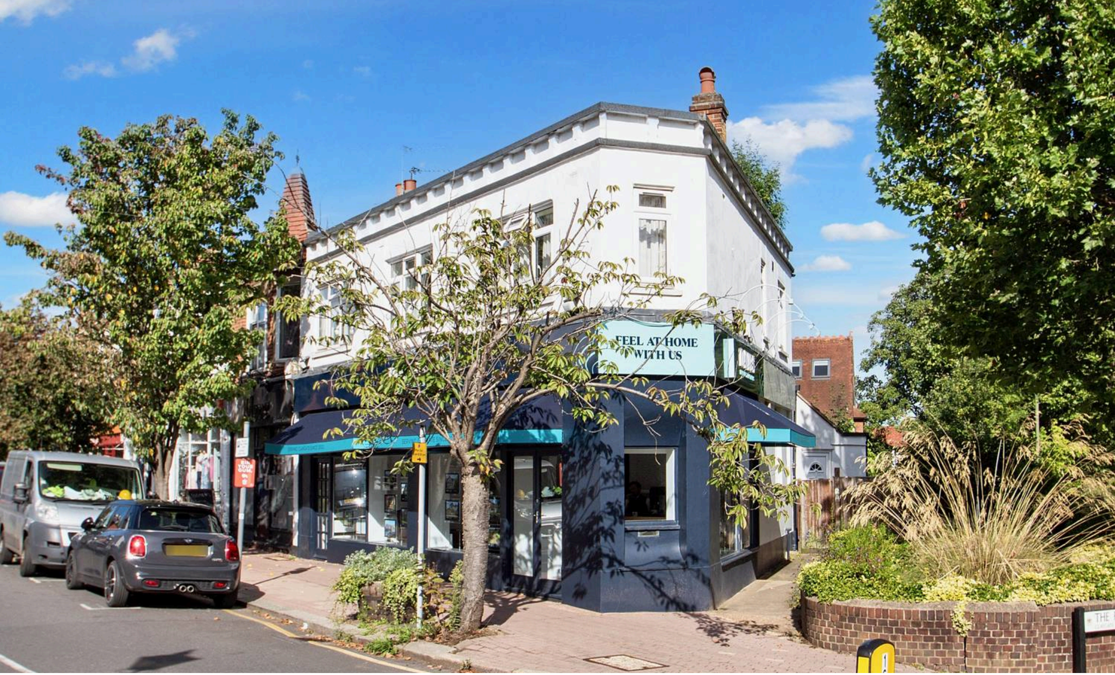
2a The Parade, Claygate £1,525 pcm