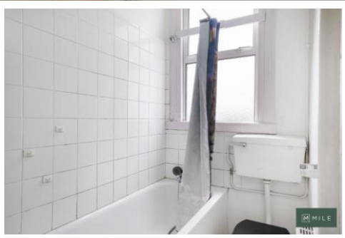
Grange Road, London NW10 £420,000 Share of Freehold

Welcome to Grange Road. Discover this charming two-bedroom, ground-floor garden apartment located on a peaceful residential road in the heart of Willesden Green. Offered chain-free and with a share of the freehold, this property presents a fantastic opportunity for buyers seeking a home with excellent potential to modernize and make their own. The apartment features a bright and spacious reception room with characterful bay windows, two well-proportioned bedrooms, and a three-piece bathroom. The kitchen diner flows seamlessly into the kitchen area, offering direct access to the garden-ideal for outdoor dining, entertaining, or simply relaxing in your own green space. Spanning 607 square feet, the property provides a solid foundation to create your dream home. Willesden Green is a highly sought-after area, celebrated for its vibrant community feel and excellent transport links. With the Jubilee Line at Willesden Green Station just a short walk away, commuting into Central London is a breeze. The neighbourhood also boasts an array of independent cafes, restaurants, and shops, along with green spaces such as Gladstone Park, perfect for leisurely strolls or weekend activities. This property is an excellent investment for first-time buyers, downsizers, or those looking to add value to a home in a fantastic location. Don't miss this opportunity-schedule your viewing today!