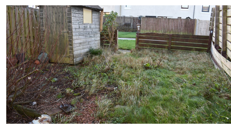
118 Staunton Rise