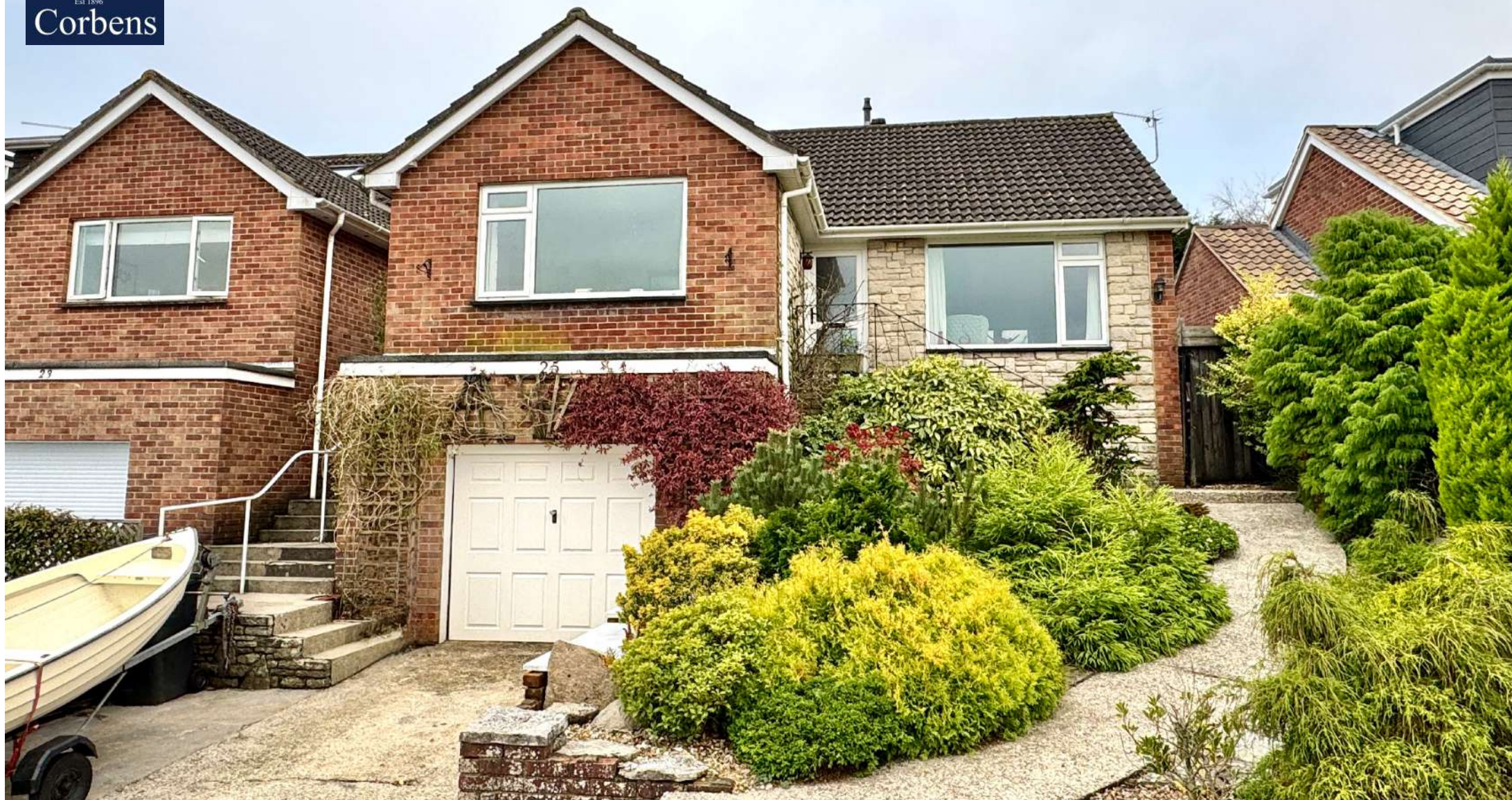
25 CAULDRON CRESCENT, SWANAGE £625,000 Freehold