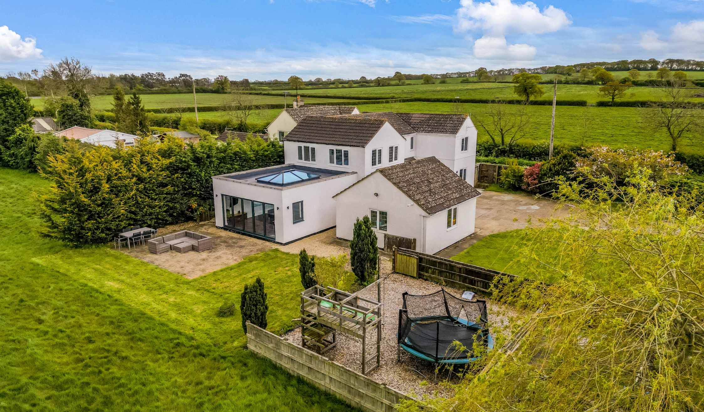
Cherry Tree House Leigh | Wiltshire | SN6 6RH