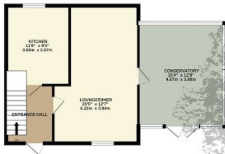
GROUND FLOOR 594 sq.ft. (55.2 sq.m.) approx.