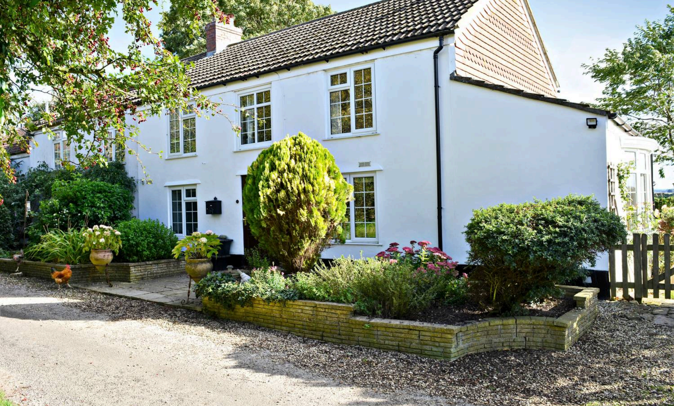
Millers Cottage, Winterbourne Monkton £1,450 pcm