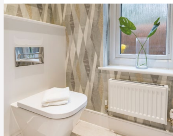
Photography from previous Places for People development.