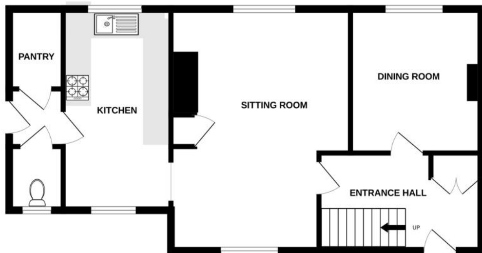
GROUND FLOOR 638 sq.ft. (59.2 sq.m.) approx.