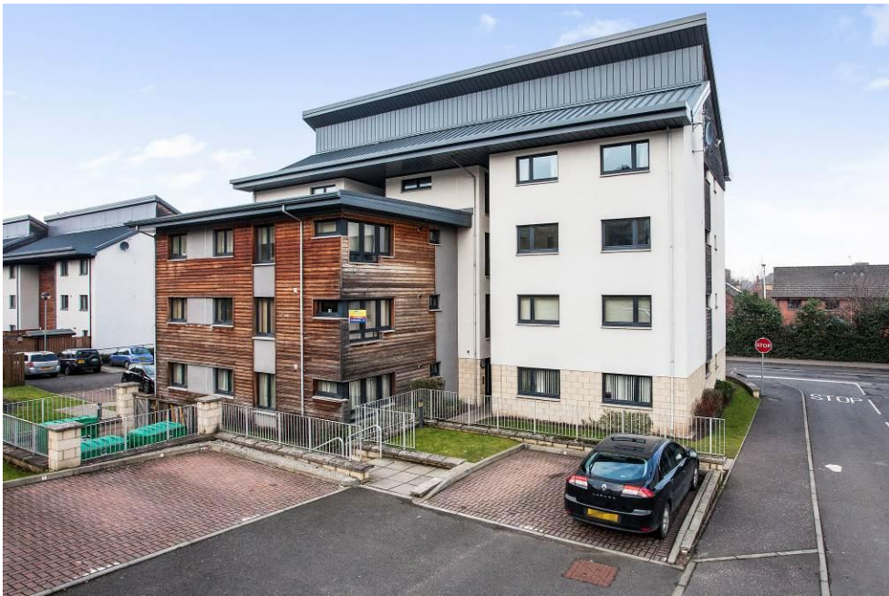
Next Home - 68 Morris Court, Perth, PH1 2SZ