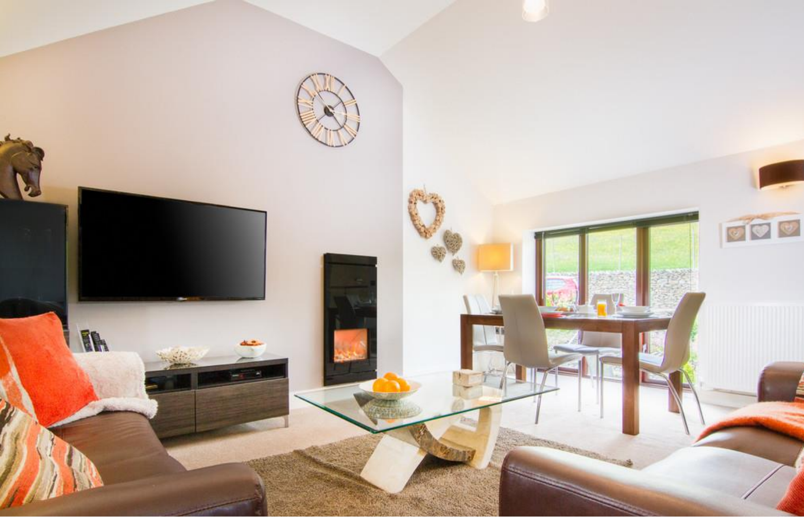
Open Plan Living