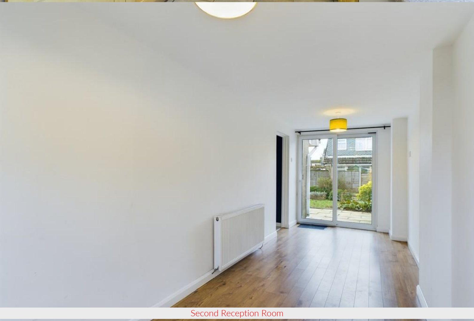
Second Reception Room