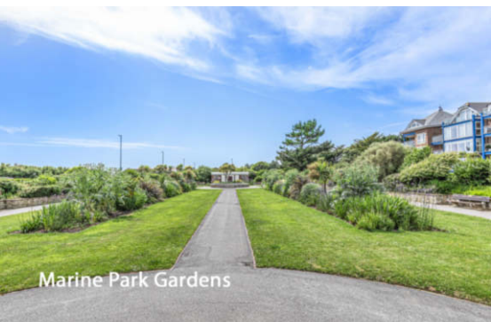
Marine Park Gardens