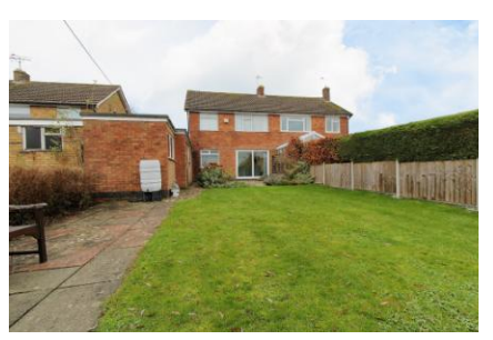
EPC to follow ..