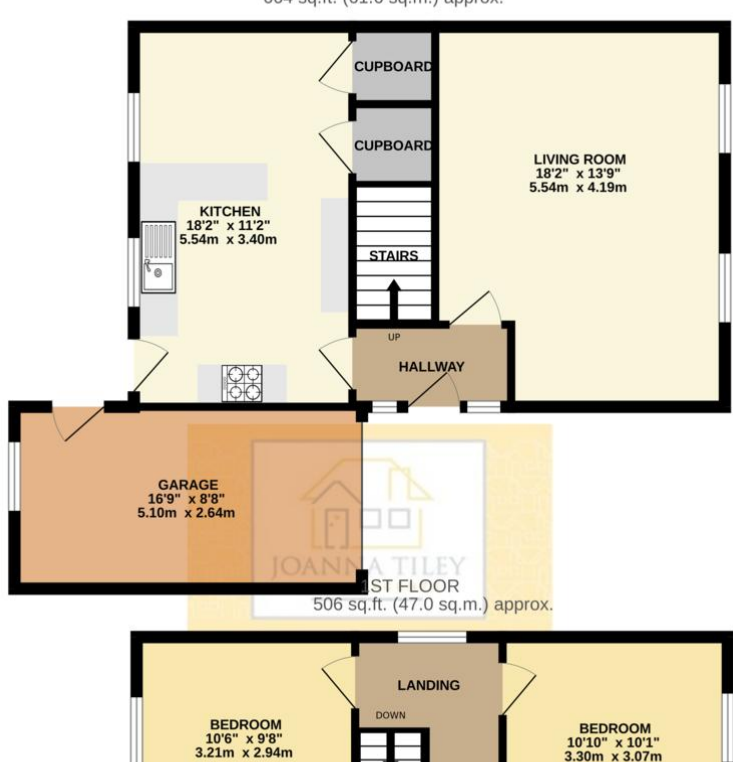
TOTAL FLOOR AREA: 1170 sq.ft. (108.7 sq.m.) approx.