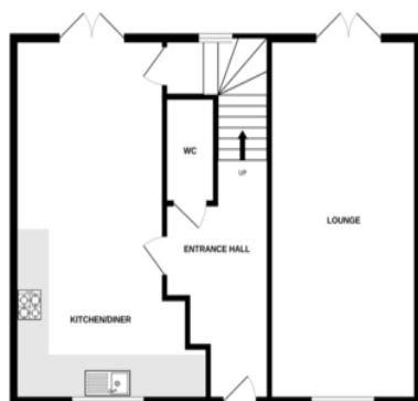
GROUND FLOOR 736 sq.ft. (68.4 sq.m.) approx.