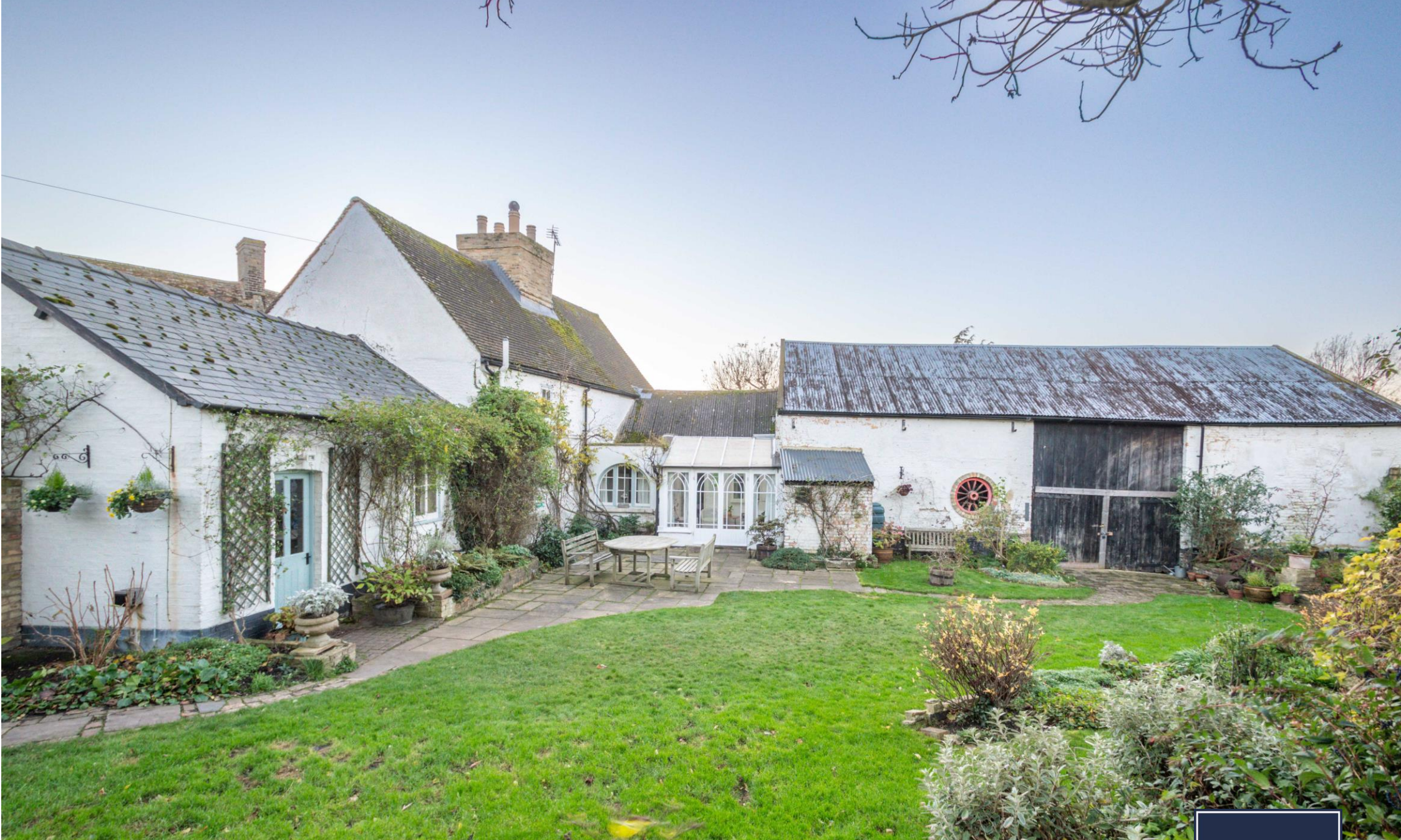
The Old Post Office Reach, Cambridgeshire