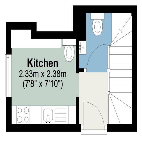
First Floor Approx. 13.4 sq. metres (143.8 sq. feet)

Approx. 10.8 sq. metres (116.6 sq. feet)