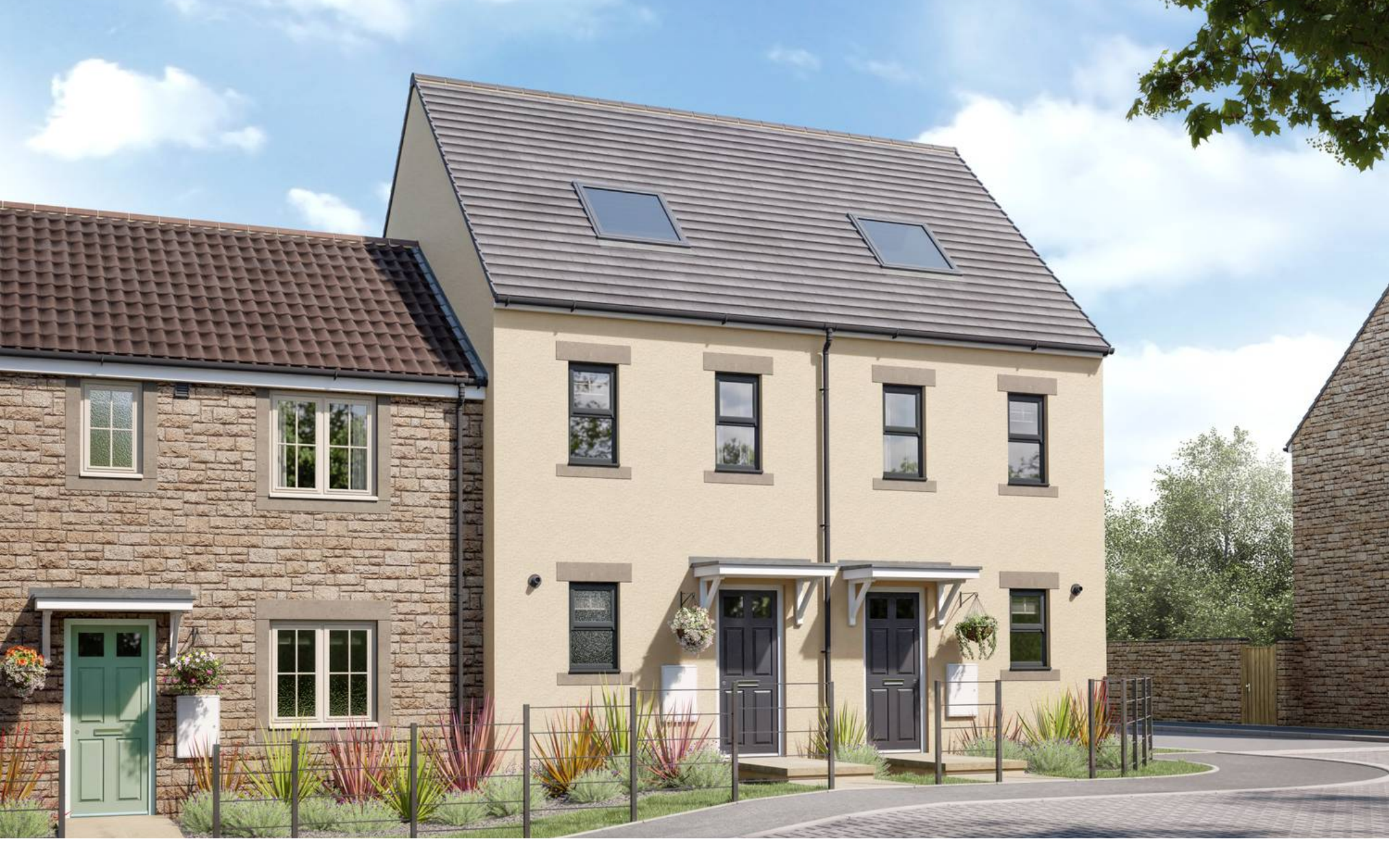
Moseley, Sillars Green, Tetbury Road