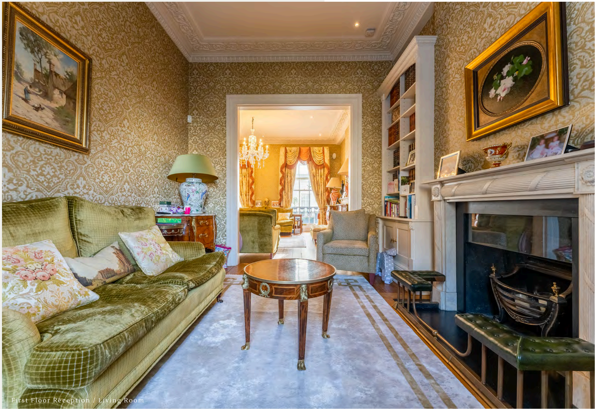
First Floor Reception / Living Room