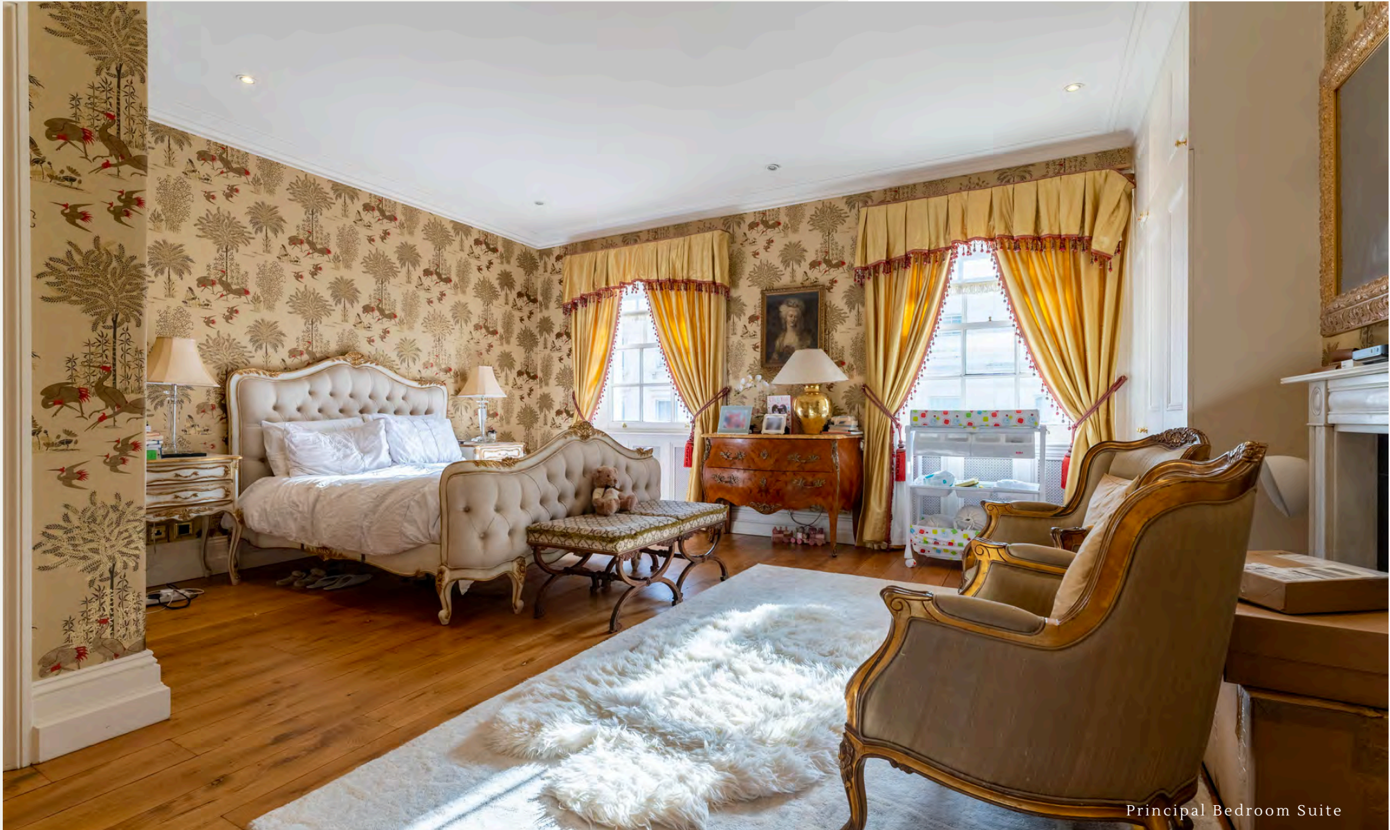
Principal Bedroom Suite