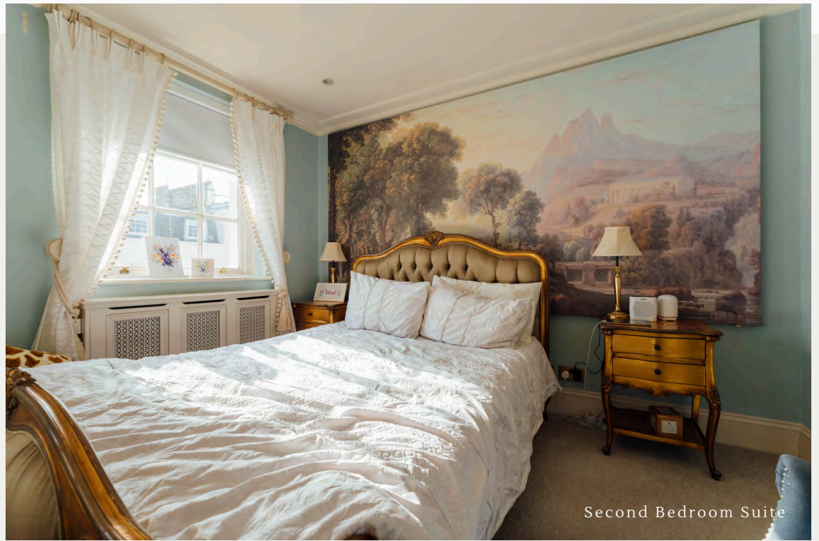
Second Bedroom Suite