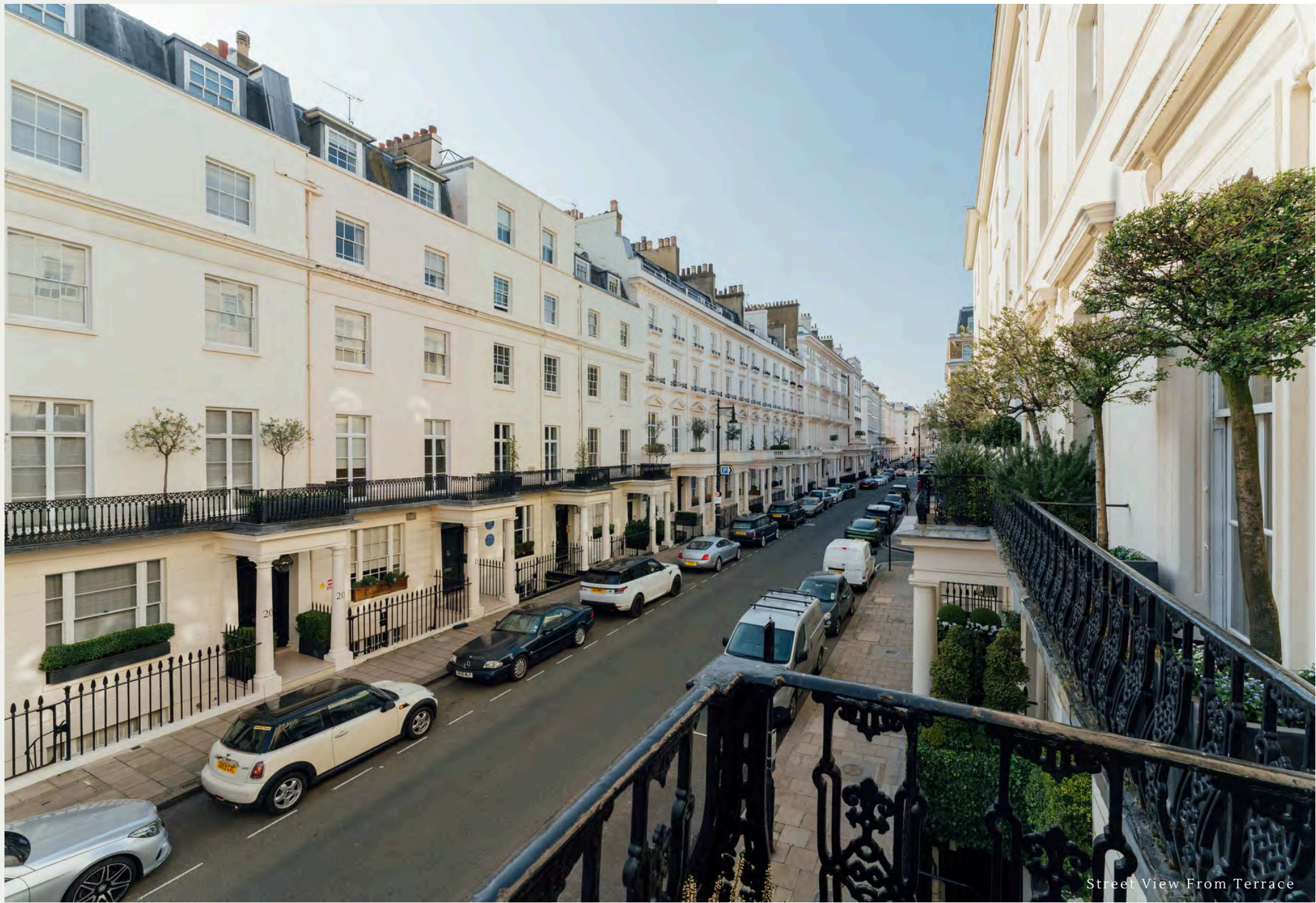
Street View From Terrace