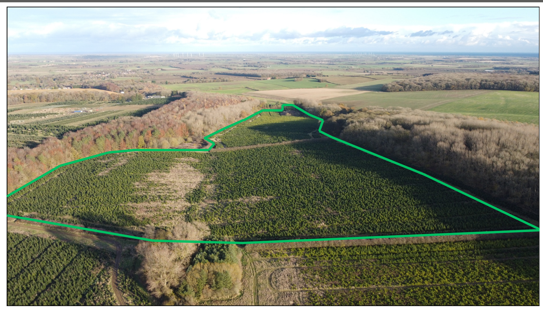
Lot Three (edged green above)

Lot Three comprises circa 54.50ac (22.06ha) (STS) situated to the East of Lot Two and consisting of approximately two Grade 2 agricultural land field parcels also planted with Nordmann Fir Trees from 2010 and with direct access off Haugham Pastures or a potential right of way through Lot 2.