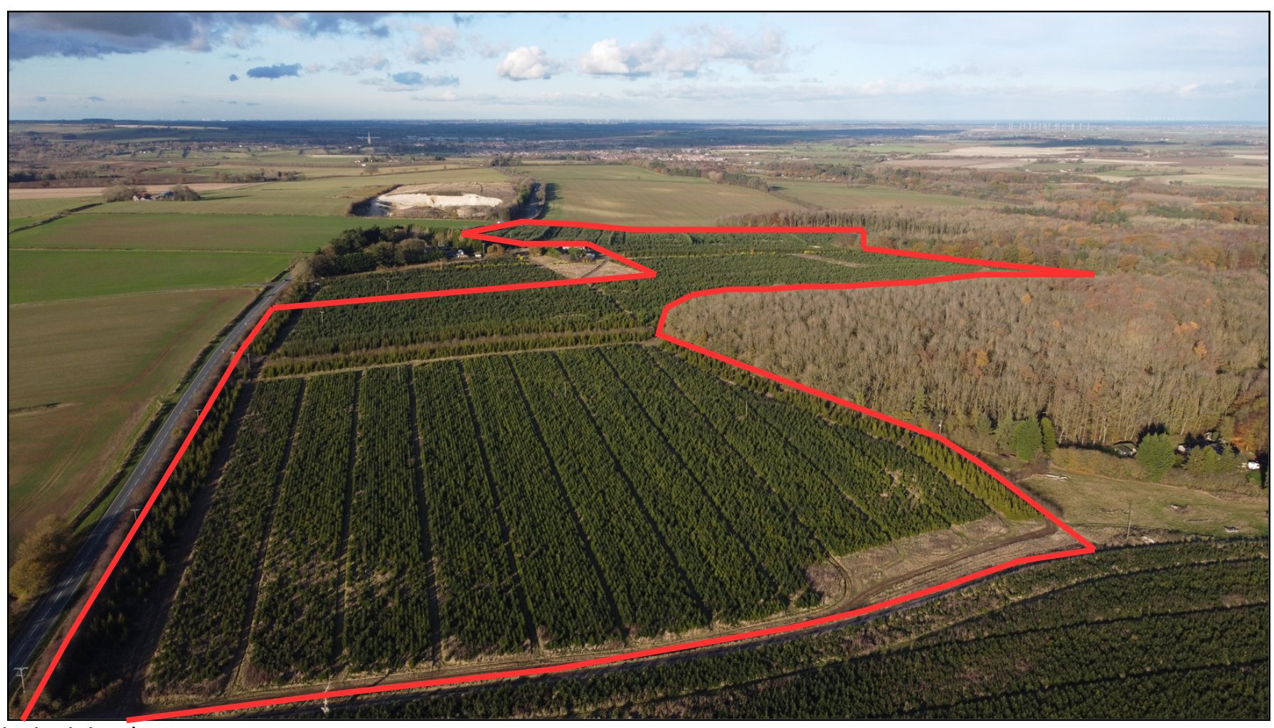
Lot One (edged red above)

Lot One comprises circa 82.88ac (33.54ha) (STS) or thereabouts of good quality Grade 2 agricultural land positioned in a large block directly east off the A16 at Tathwell. Approximately four field parcels make up the block and all benefit from internal tracks. The soil is of the Tathwell Series and comprises base rich loamy, highly fertile soils.