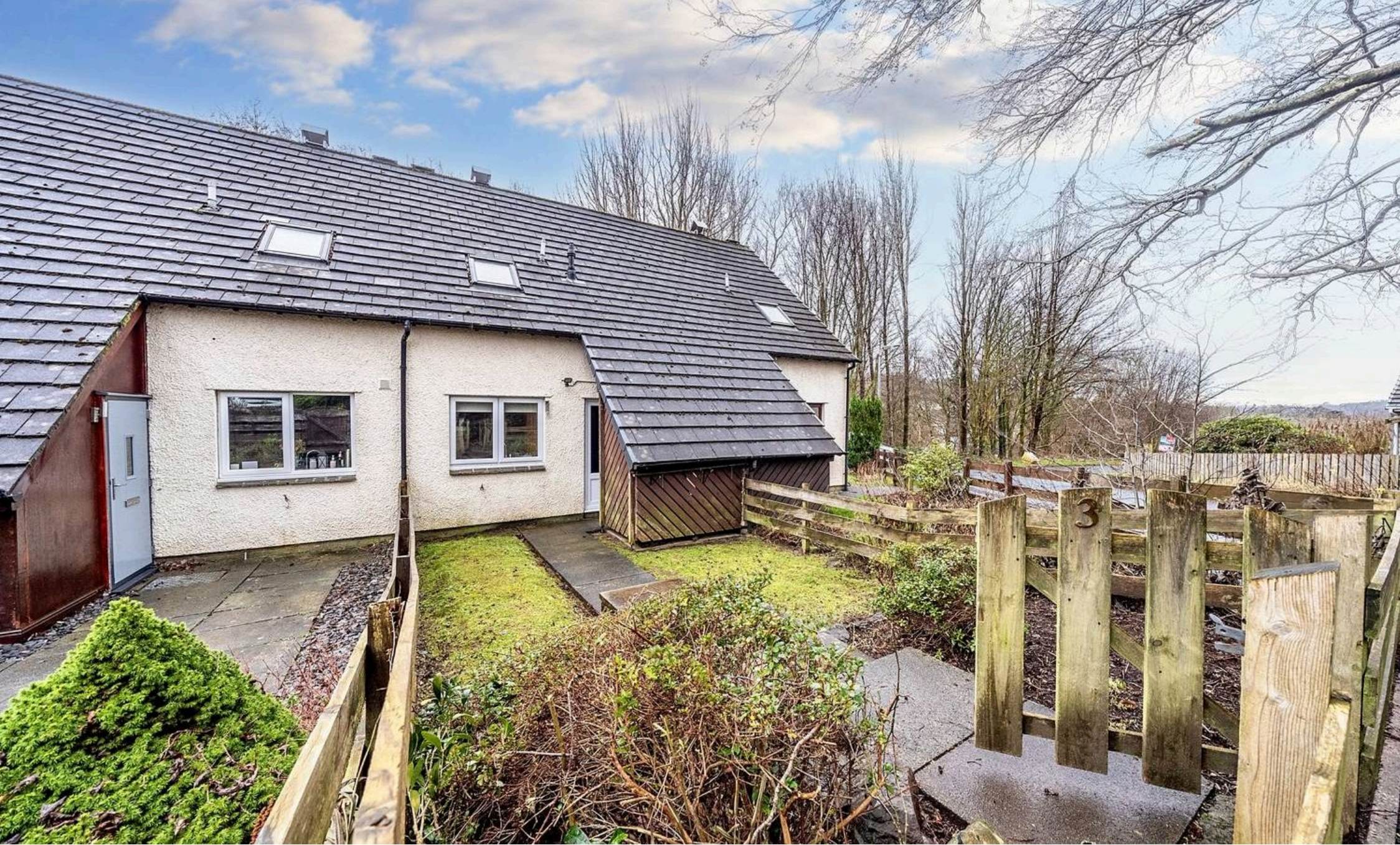
3 Droomer Lane, Windermere £230,000