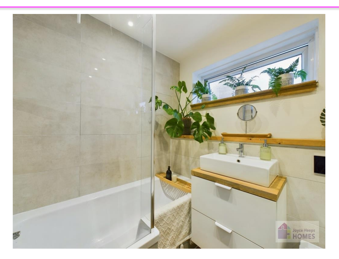
The property is tastefully decorated in neutral tones throughout and has ample storage.