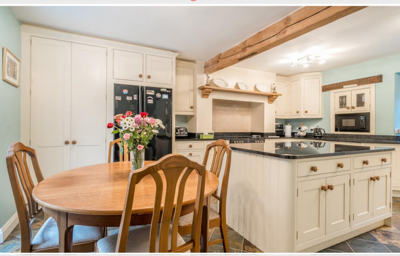
Kitchen Dining Room