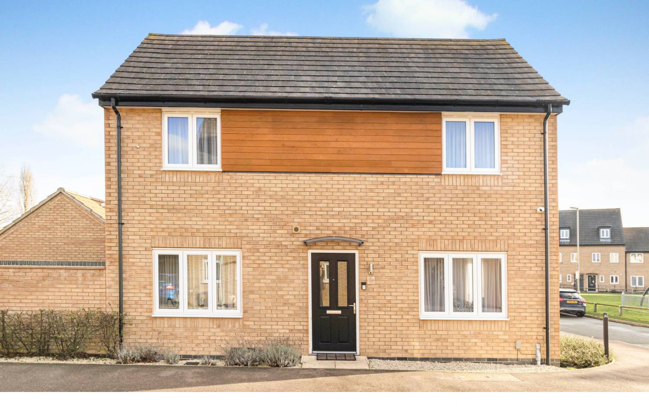
53 Wheatstone Road, Huntingdon £280,000