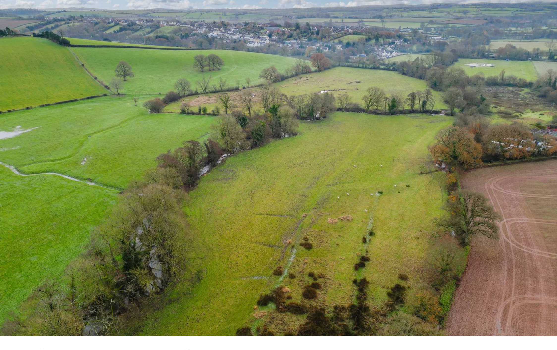
Land at Burston, Bow, EX17 6LA