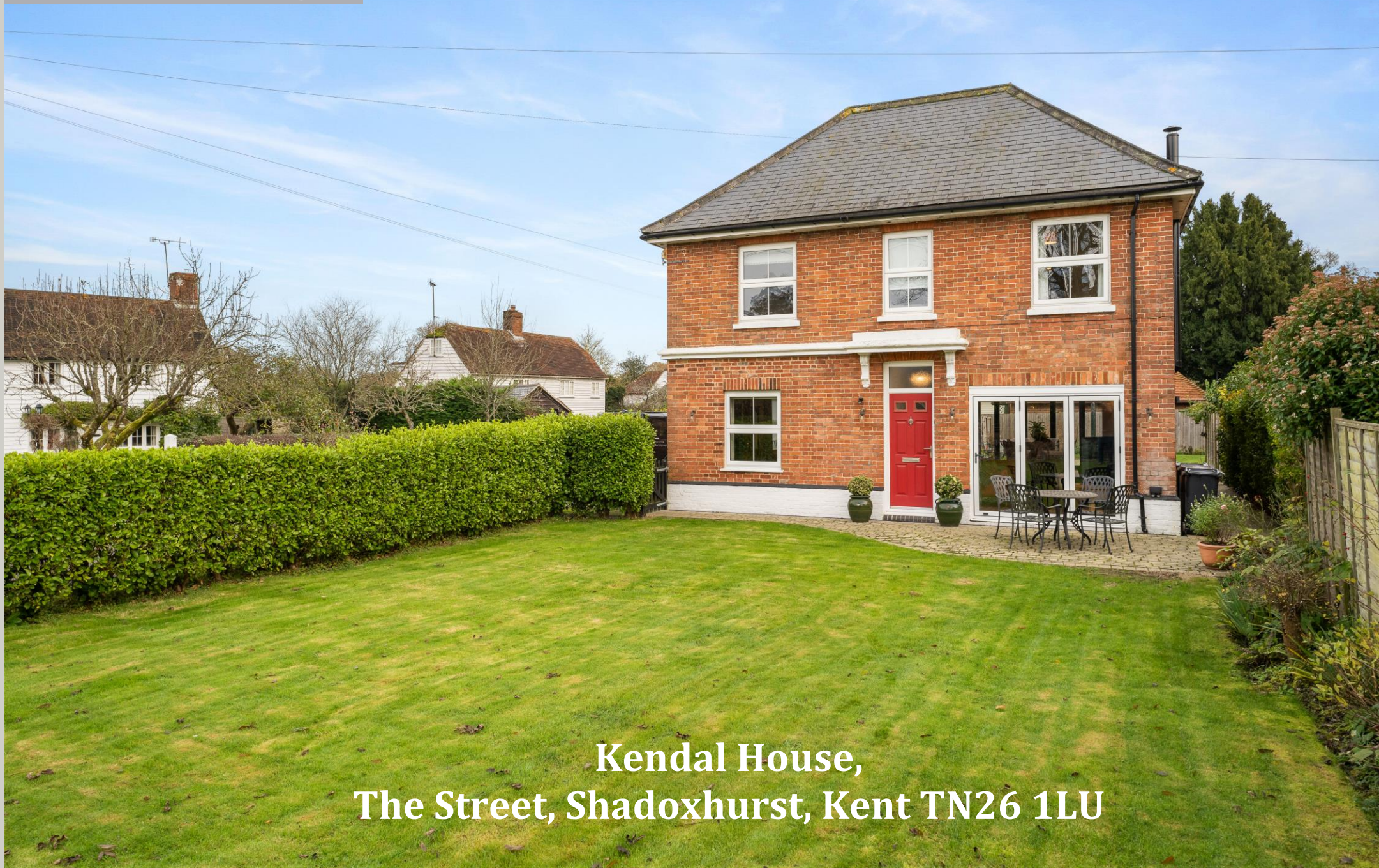
Kendal House, The Street, Shadoxhurst, Kent TN26 1LU