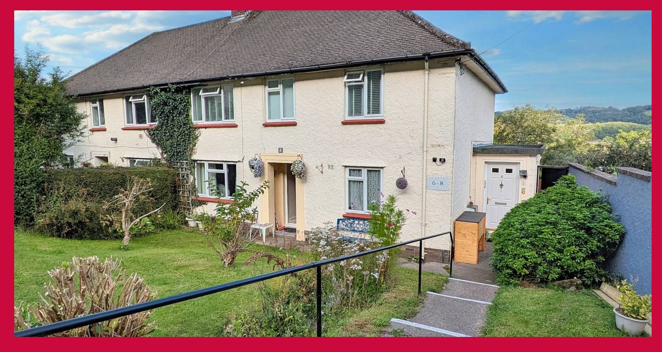
8 Garth Olwg, Gwaelod-Y-Garth Cardiff