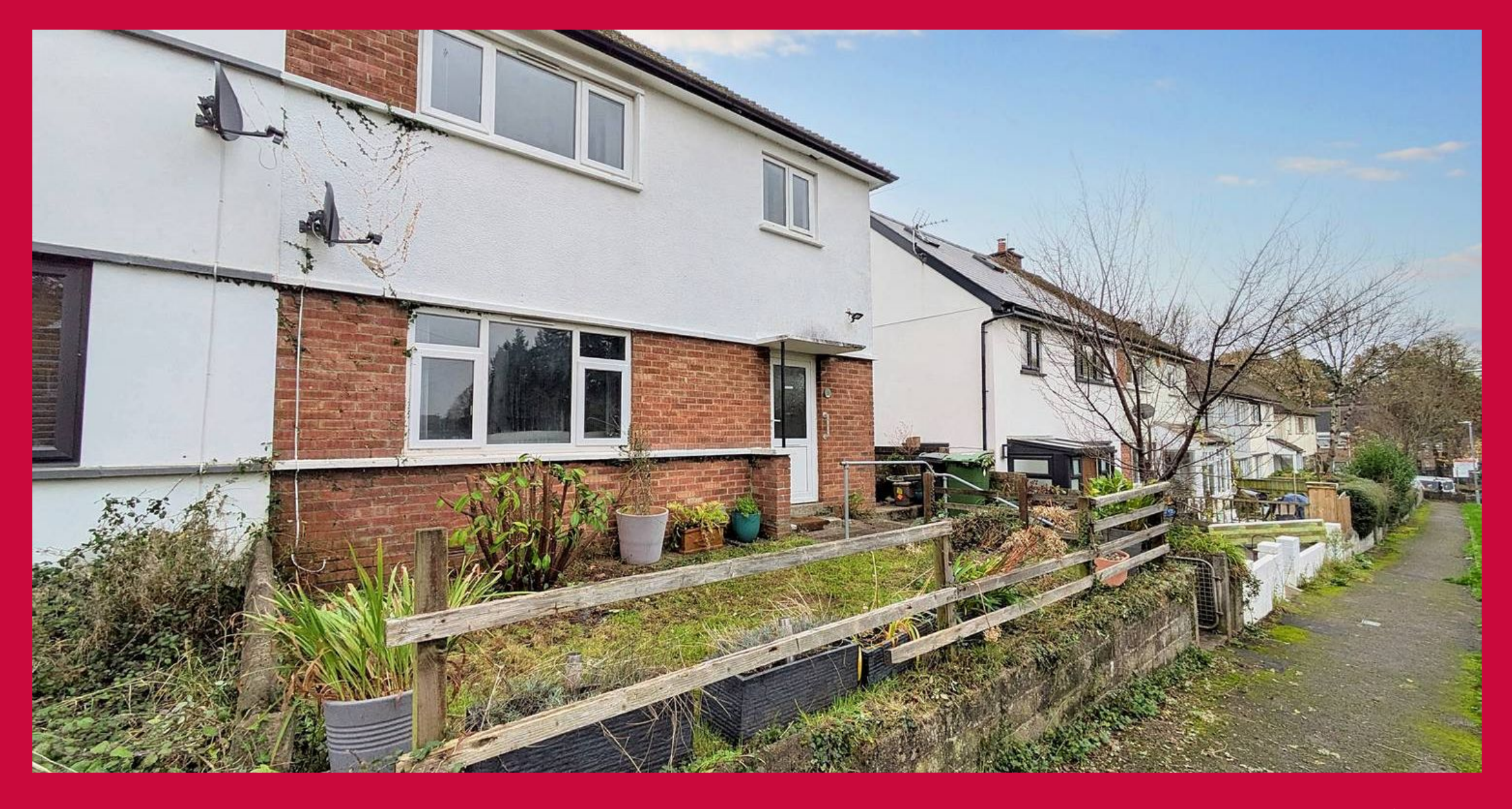
34 Plasmawr Road, Cardiff