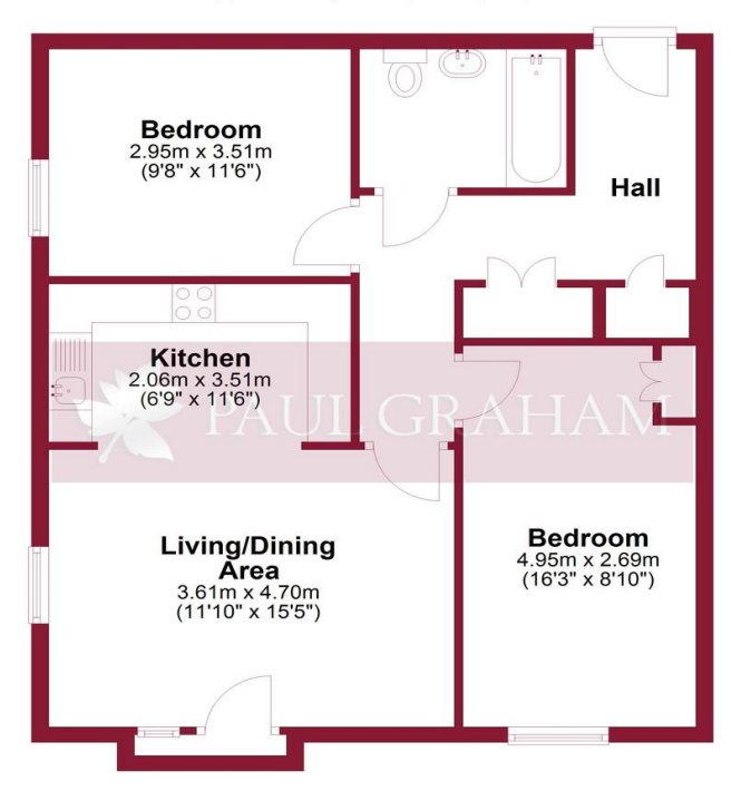
Total area: approx. 66.7 sq. metres (717.5 sq. feet)

Approx. 66.7 sq. metres (717.5 sq. feet)