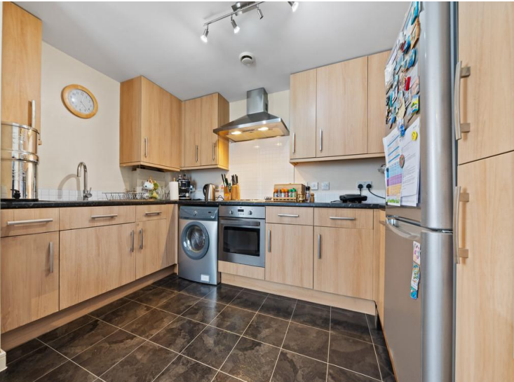
Flat 5, Ian Macdonald Court, Adastra Way, Wallington, Surrey, SM6 9FD | £285,000

Set on the first floor in this modern development close to excellent schools, this apartment benefits from a 15'3 lounge/dining room which opens into a fitted kitchen with built in appliances. There are two double bedrooms and a spacious bathroom. Other features include allocated parking and a long lease.