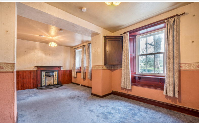
Living Dining Room