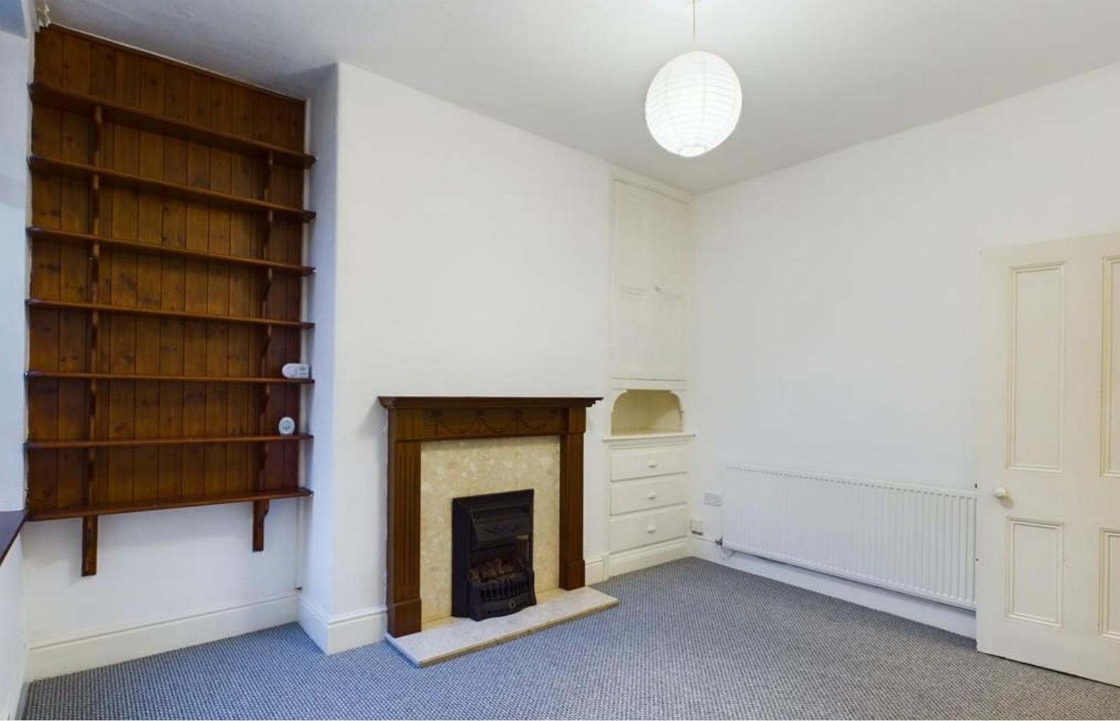
Rear Reception Room