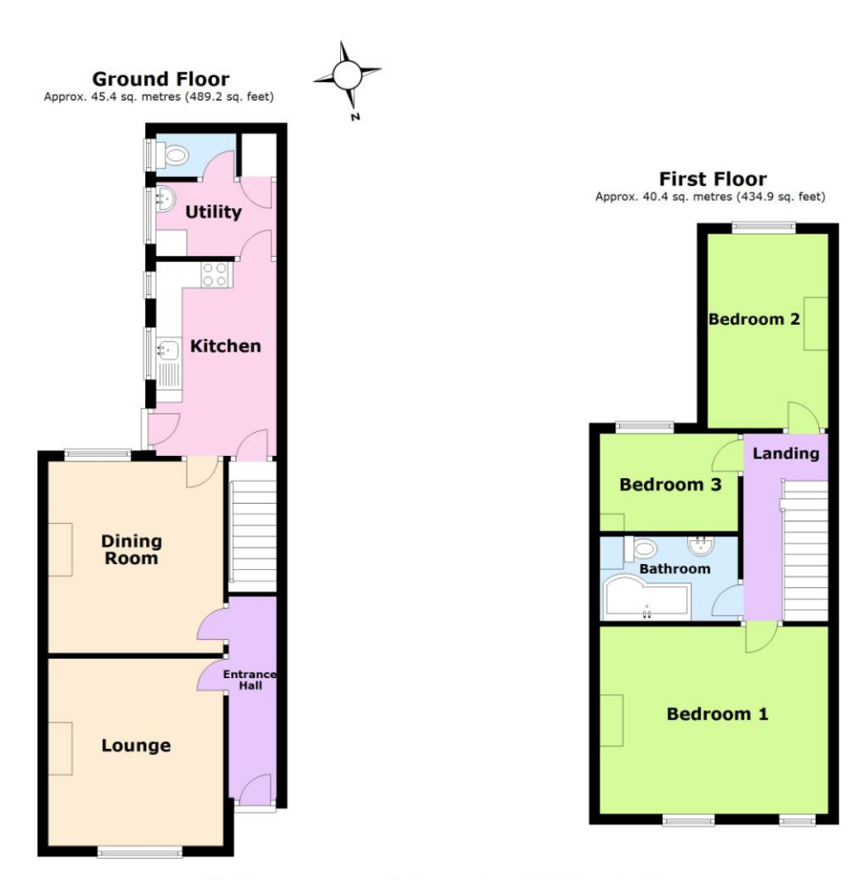
Total area: approx. 85.8 sq. metres (924.0 sq. feet)