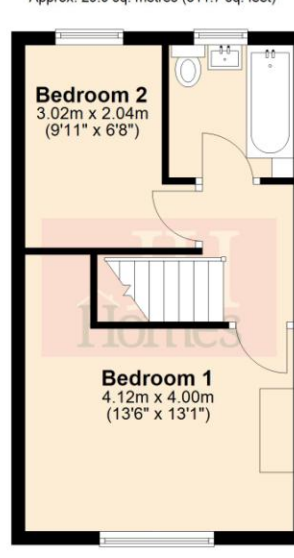
Total area: approx. 71.1 sq. metres (765.8 sq. feet)