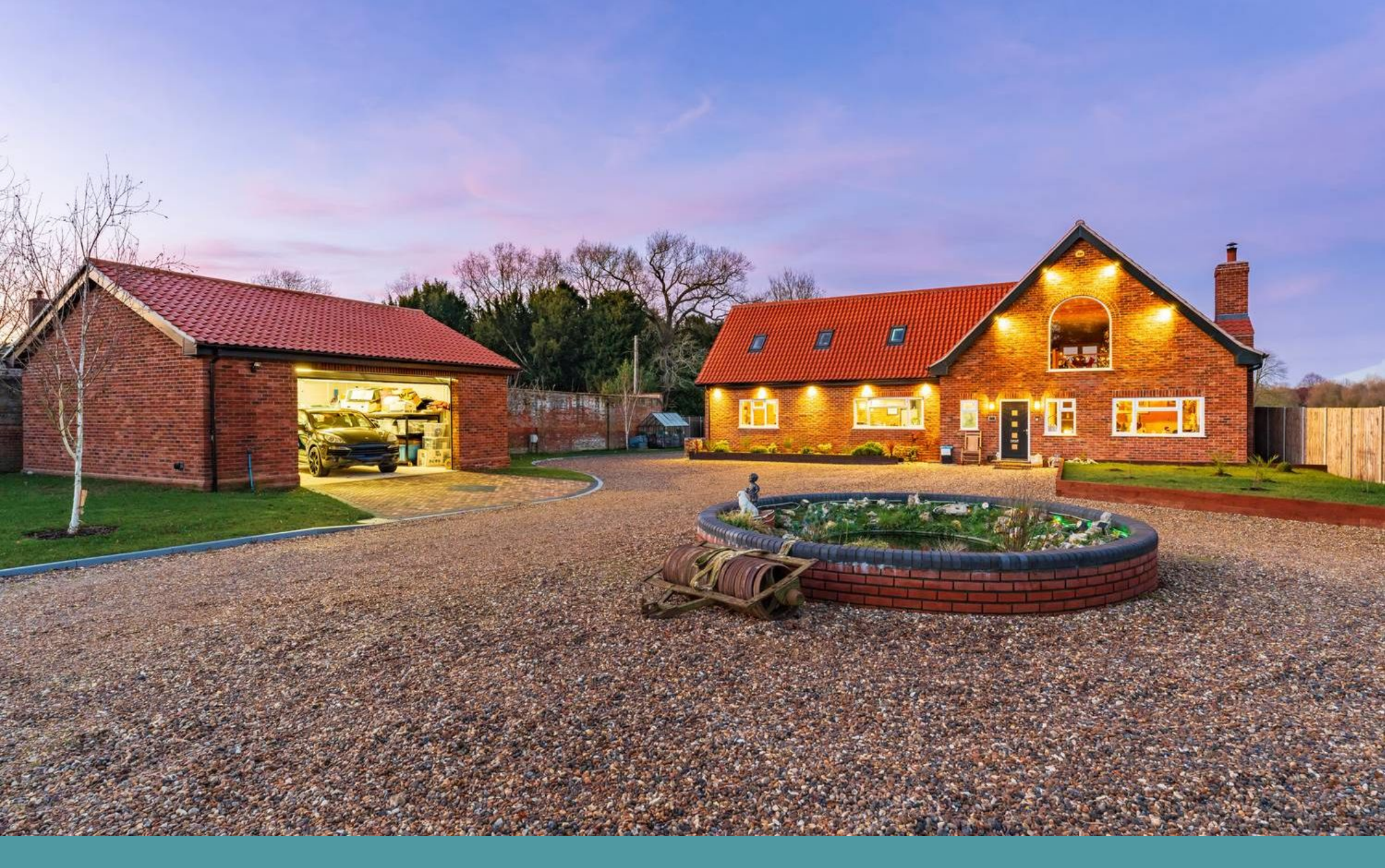
Willow Lodge Hempnall Road, Morningthorpe Offers Over £1,250,000